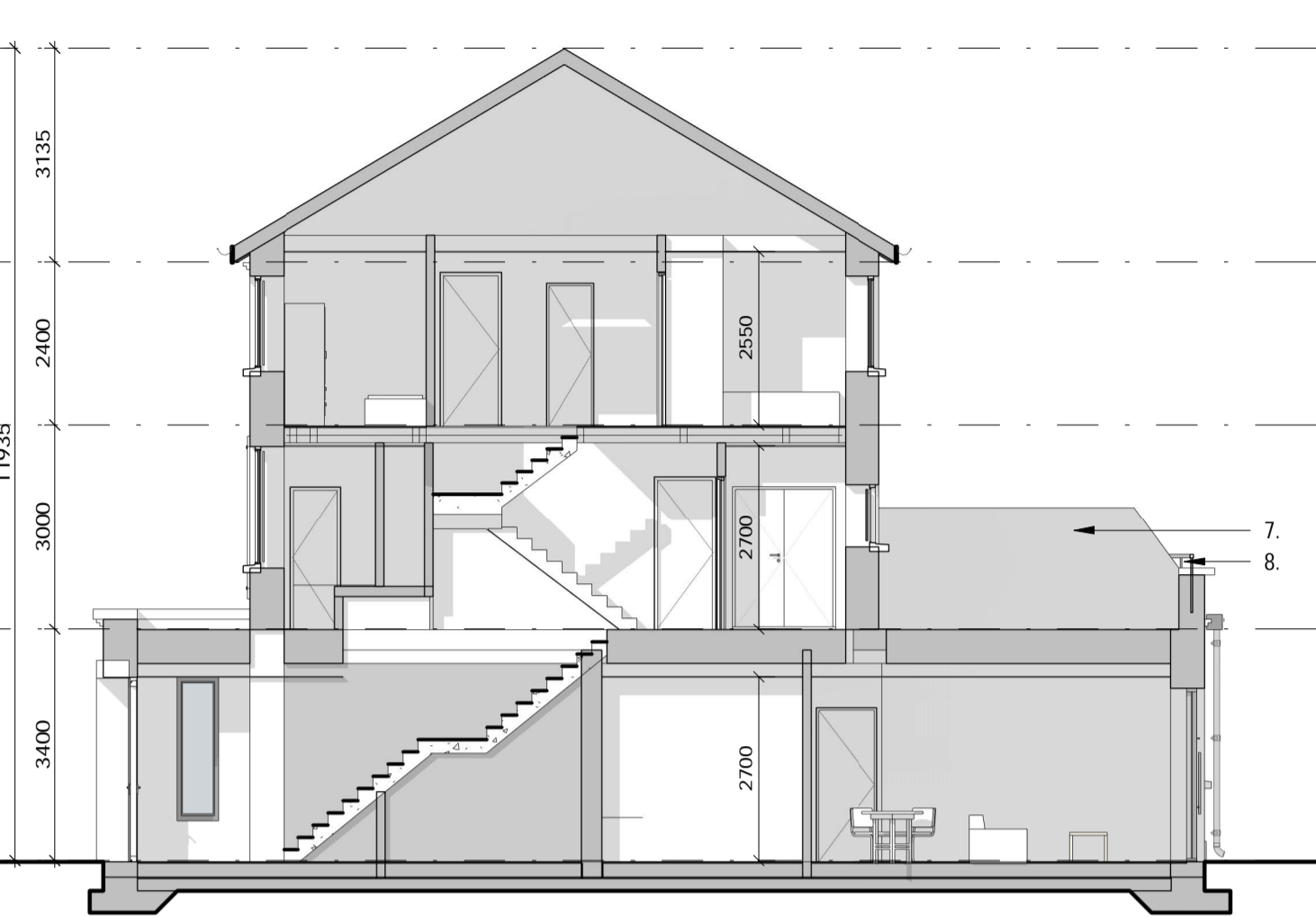
3 Section AA 1:100